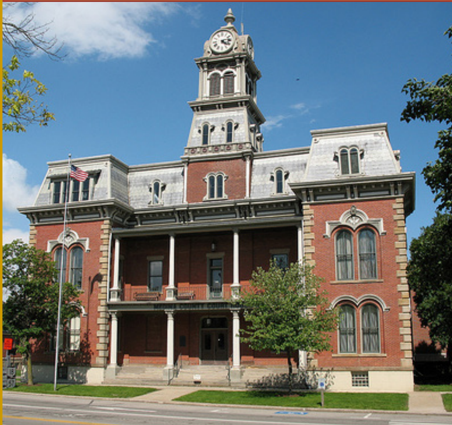
Old Court House Public Square